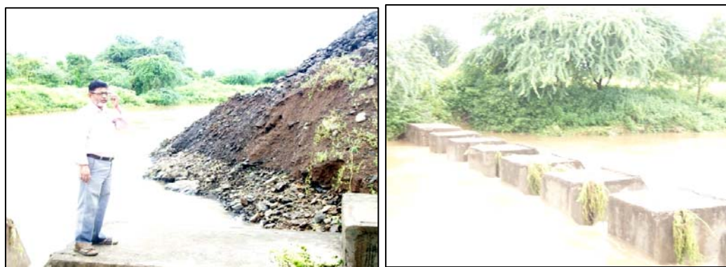
The erosion position of the Oon Stop dam without bank potation

During the joint physical inspection of the dam, we observed that the one site of downstream bank of the stop dam was damaged due to soil erosion. The photographs below show the position of erosion of the stop dam: